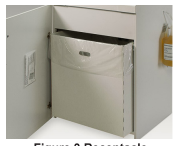
Figure 3 Receptacle

NOTE: The machine turns off automatically if it is not used after 10 minutes.