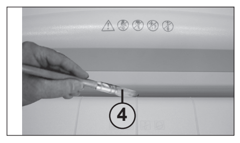
Figure 4 Cleaning the Photocells

To remove these paper strips and also to clean the photocell, pass another sheet of paper through the feed slot, or switch the machine to reverse and wipe both "eyes" of the photocell with a brush.