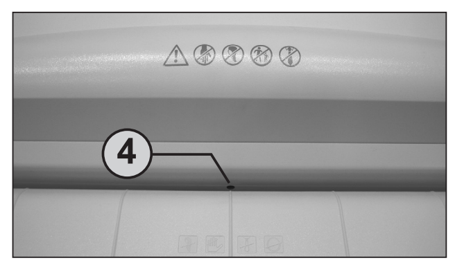
Figure 2 Light Barrier