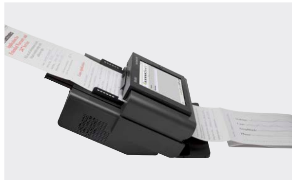
Improved paper handling