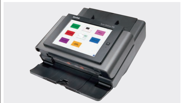
Robust build and quality