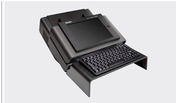
Shown with optional Kodak Scan Station Keyboard and Stand Accessory

Get the best possible performance from your scanners and software with a full range of Service and Support contracts available to protect your investment and keep productivity at peak levels. The three-year, worry-free warranty puts Kodak Alaris knowledge to work for you, helping your Kodak Scan Station 710 Scanners satisfy your changing business process needs for years to come.