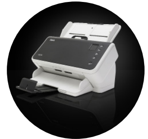
Alaris S2050/S2070 Scanners