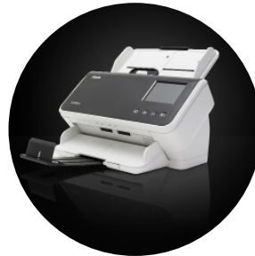
Alaris S2060w/S2080w Scanners