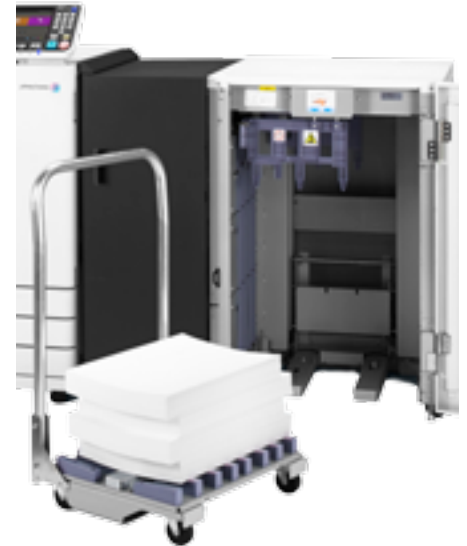
Cart not included with High Capacity Stacker.