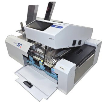
Easy to maintain: Quick access for fast cleaning and service