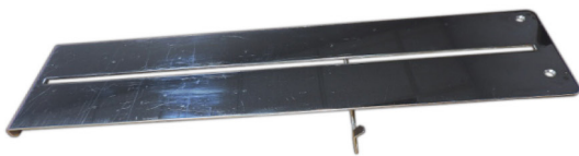
Long Media Support: For media over 14.25" (362mm) long (up to 20" (508mm) long)

Specifications are subject to change without notice.