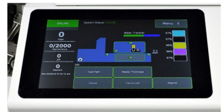
Easy to use: Large touchscreen provides full printer control and system status!

Specifications are subject to change without notice.